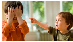
Who is to blame?

When I was growing up my parents forced me to take responsibility for my actions. Yes, occasionally I tried to blame my two older brothers—but at the end of the day I was forced to look in the mirror and admit I was the one at fault.