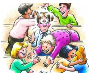
What do you say to visitors?

Do not forget to show hospitality to strangers, for by so doing some people have shown hospitality to angels without knowing it.